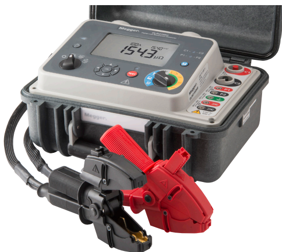
Optional CATIV 600 V Kelvin clips: two wire lead set (red/black) available in 5m, 10m or 15m lengths