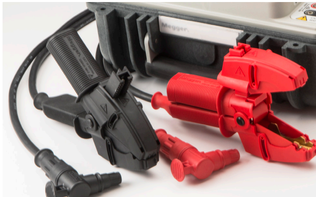
A new tough adjustable clamp has been designed to ensure flexibility in many applications and provides a good connection with the test piece