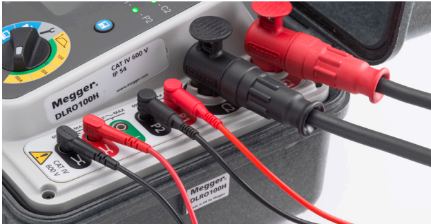
Robust, high-current CATIV leads for Kelvin configurations; current clamps for measurement on circuit breakers