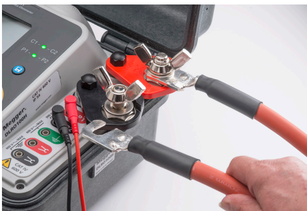
A new terminal adapter has been designed to enable the use of users own test leads.