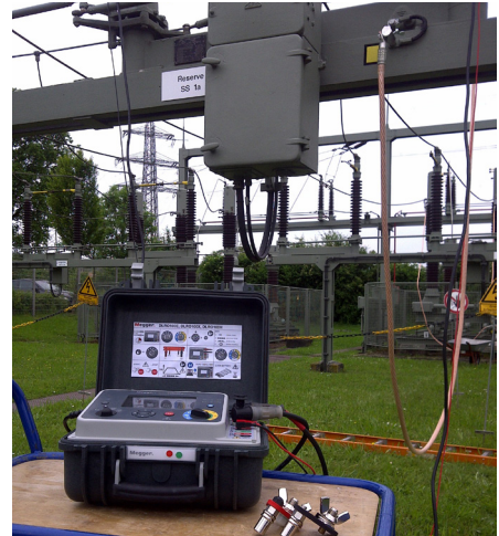
DLRO100 testing circuit breaker